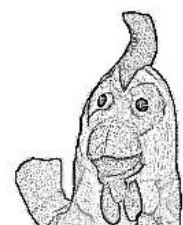
Colin the Cockerel

The story of Noah continued today with 40 days of rain packed into the two hour session in The Rainbow Tent. No wonder there was a flood!