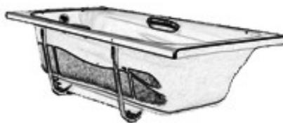
The BIG Top pond!

In The BIG Top drama we saw that Parkie had made the old bath into a pond. Now he is working hard with the children to paint things in the park – just watch out where you sit down for the next few days! Barry has learnt that he has to be especially careful.